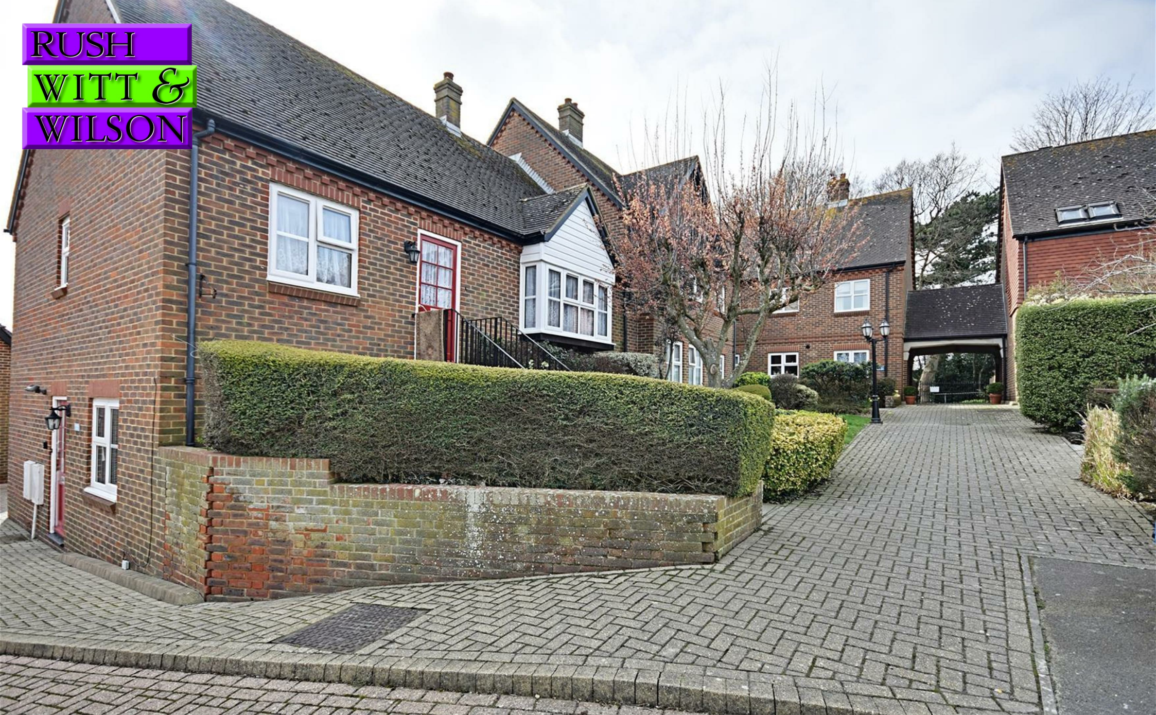
67 Rotherfield Avenue, Bexhill-On-Sea, East Sussex TN40 1SY £149,950 Leasehold